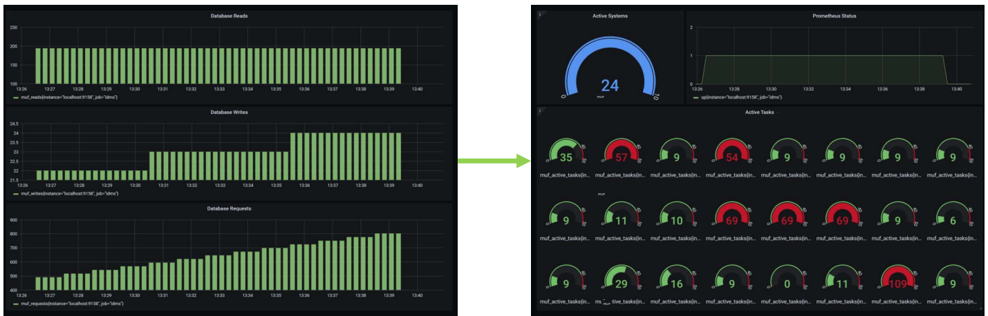
Figure 3: Sample Use Case

In Figure 3, a JSON exporter invokes the CA Datacom RESTful API every five minutes, populates a time series database called Prometheus, and is represented graphically by a web-enabled analytics product called Grafana. These tools not only aid displays but are configurable for alerts and rules logic.